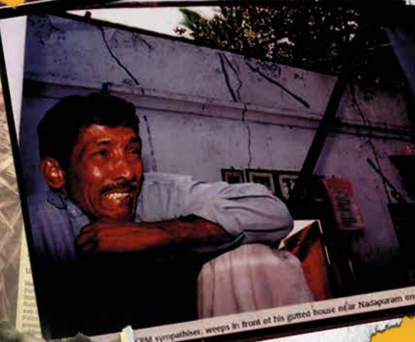
CPM sympathiser, weeps in front of his gutted house near Nadapuram...